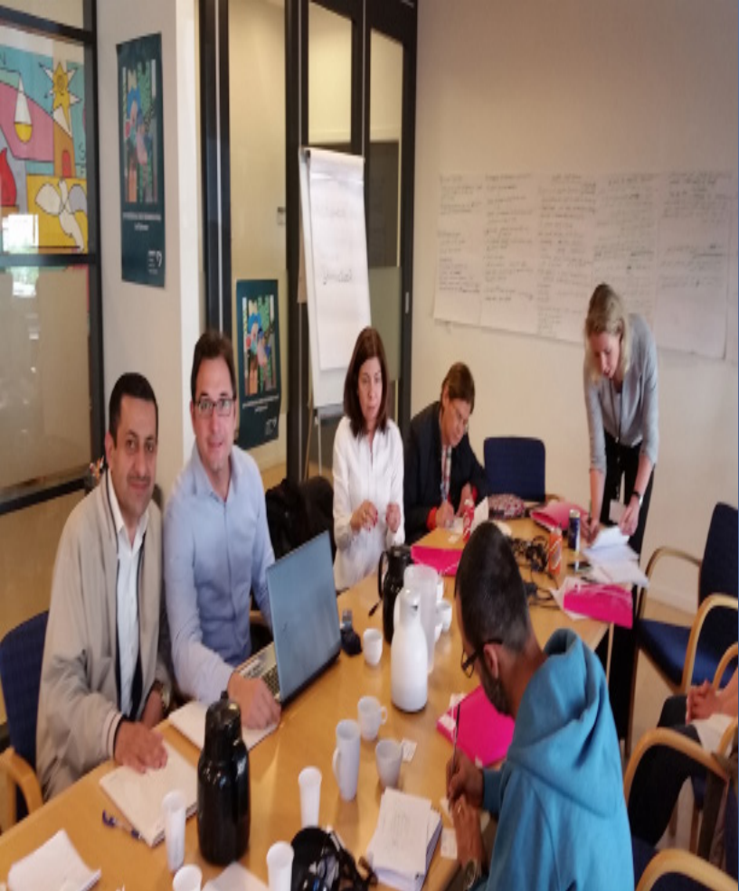
Meeting of the working group on Health MENA regional forum for monitoring of places of detention and prevention of Torture Denimark - Copenhagen